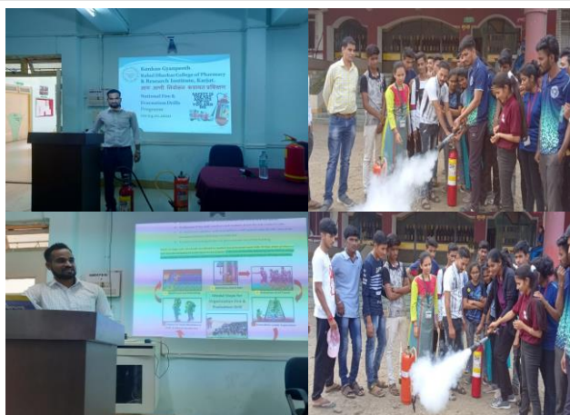
Lecture On Fire Safety Training