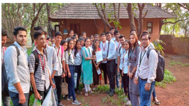
Felicitations ceremony at Madhavbaug