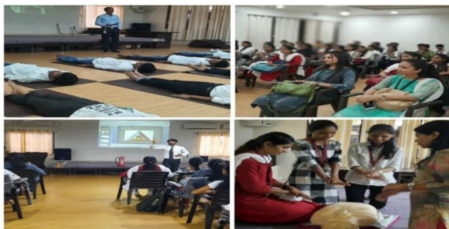
Activities carried out at Madhavbaug