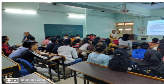
Guest lecture on Endocrine system