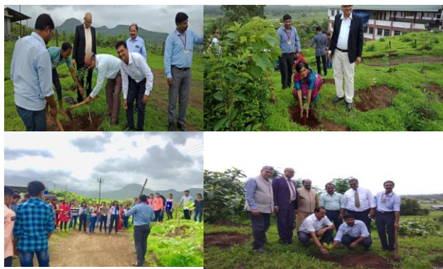
Tree Plantation Principal, Faculty & Students