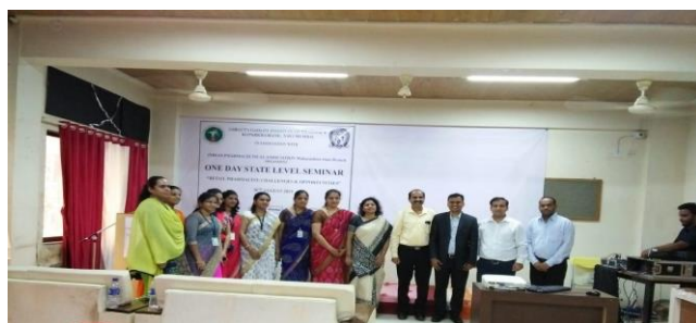
Faculties attending Seminar