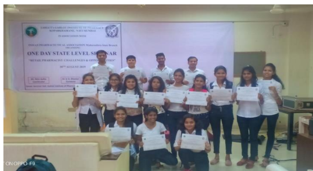
Students receiving certificate