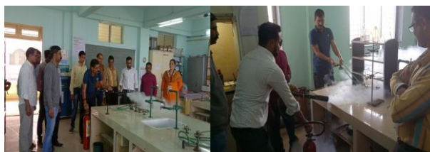
Demonstration in Practical Laboratory