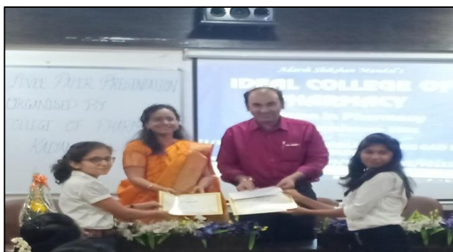
Prize distribution ceremony at Ideal College, kalyan