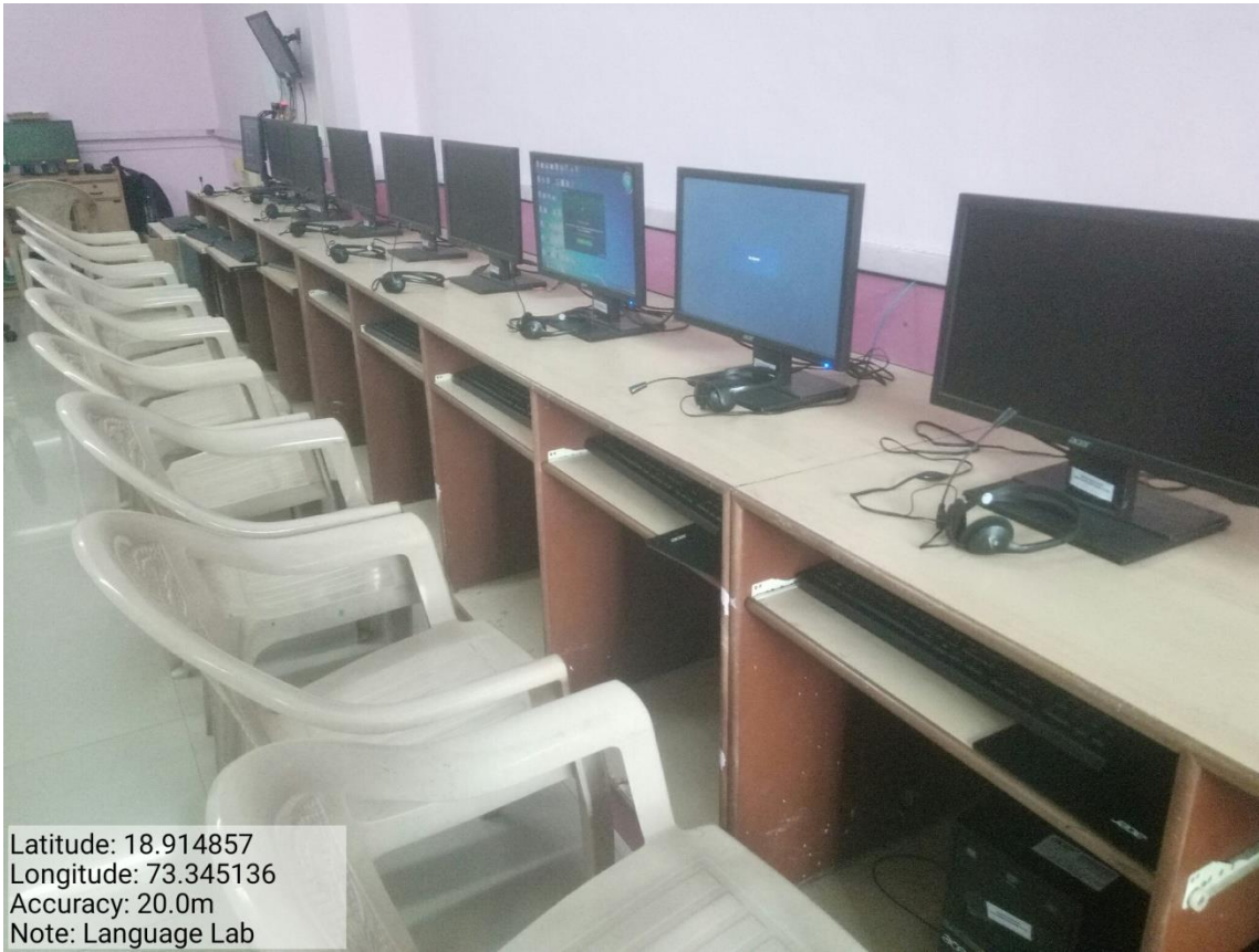
Latitude: 18.914857 Longitude: 73.345136 Accuracy: 20.0m Note: Language Lab